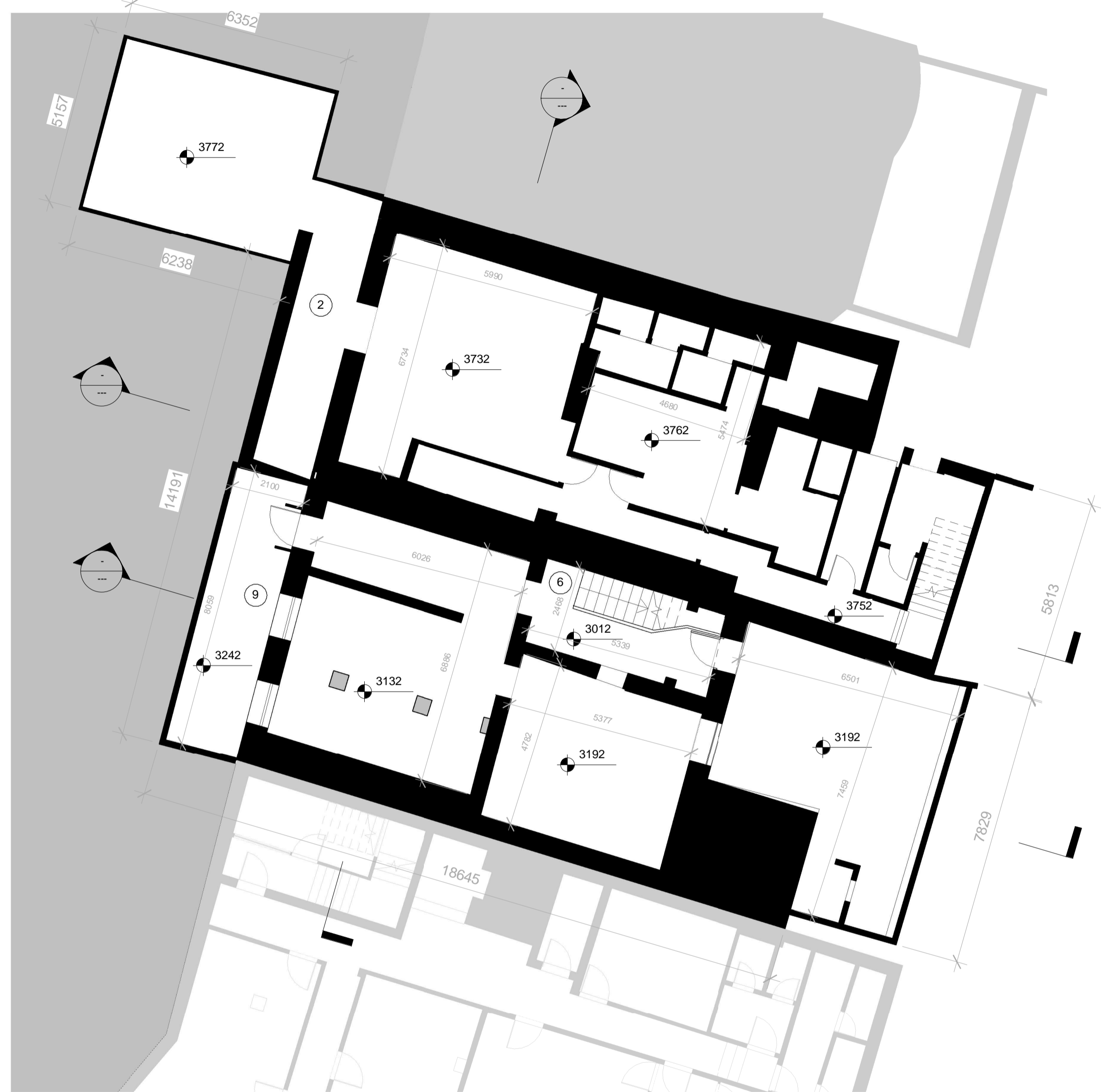
1 Existing Basement Floor Plan