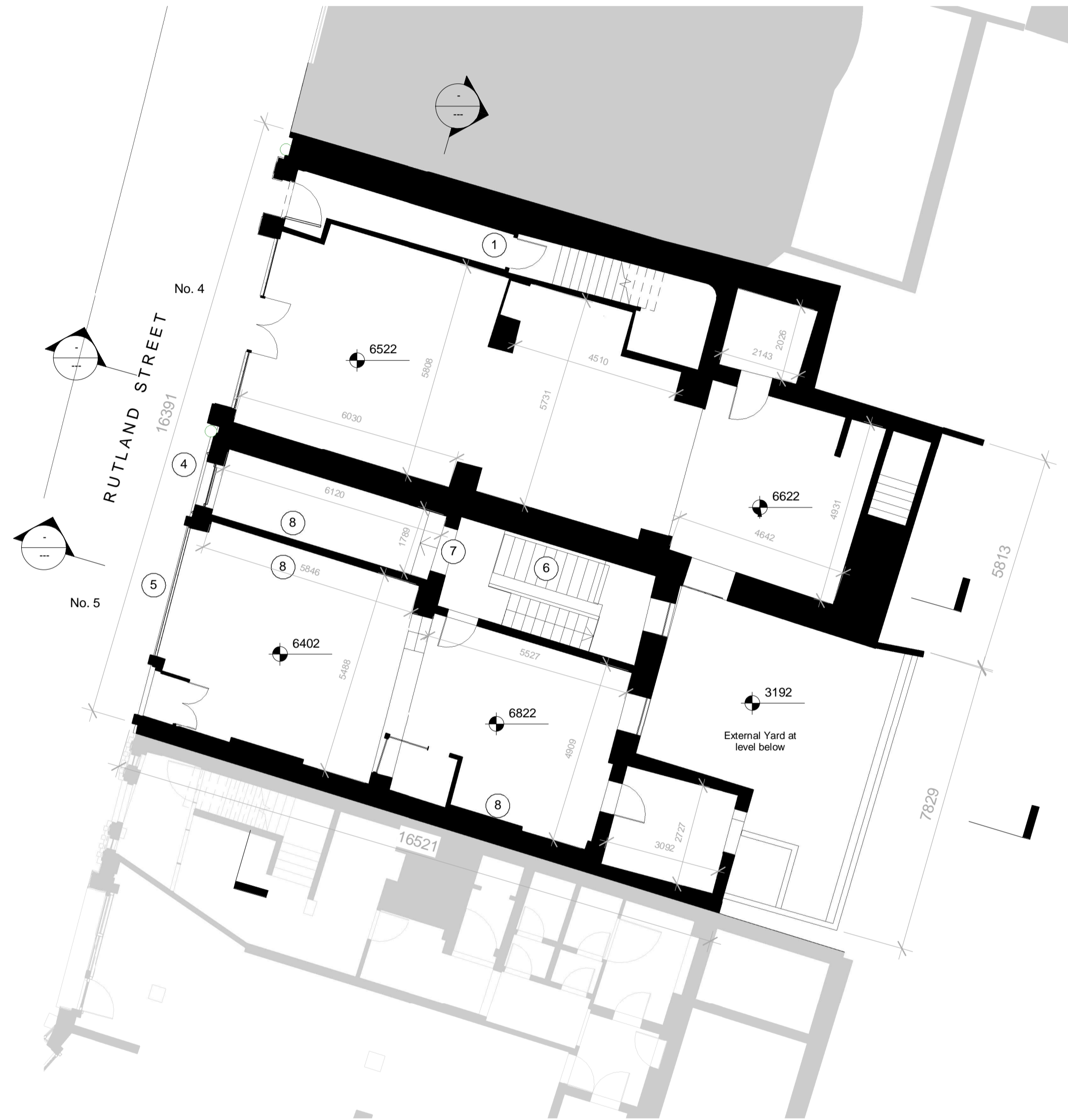
2 Existing Ground Floor Plan